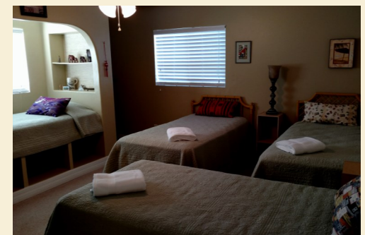
Around The Globe