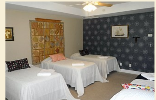
At Sea Room